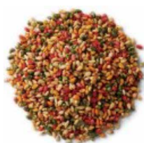
Umami Toppers 'Rainbow Sesame' Mixed Seasoned Sesame Seeds