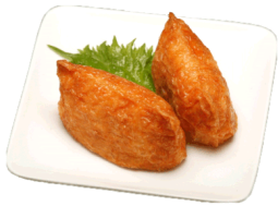
Ajitsuke Inari Seasoned Fried Bean Curd (Gluten Free)