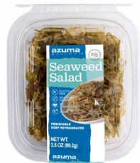
Seaweed Salad Vegan (3.5oz) Sesame Seaweed Salad