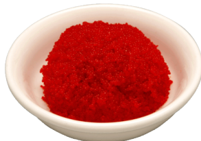
Masago Umami 'Habanero' Seasoned Capelin Roe