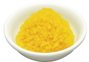
Masago Umami 'Yuzu' Seasoned Capelin Roe 'Yuzu'