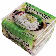
Tako Wasabi Retail Seasoned Octopus with Wasabi