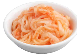
Plant-Based Crab Salad