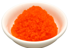
Masago Seasoned Capelin Roe