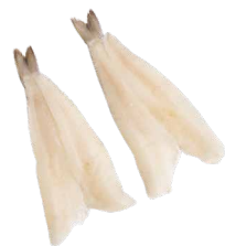
Kisu Hiraki Whiting Butterfly Cut