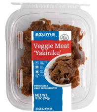
Veggie Meat 'Yakiniku' (3oz) Seasoned Soy Protein with BBQ Sauce