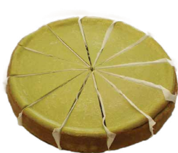
Cheesecake 'Green Tea'