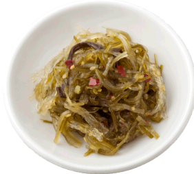
Goma Wakame "Delight" Sesame Seaweed Salad