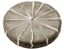
Cheesecake 'Black Sesame'