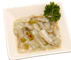
Tako Wasabi Seasoned Octopus with Wasabi