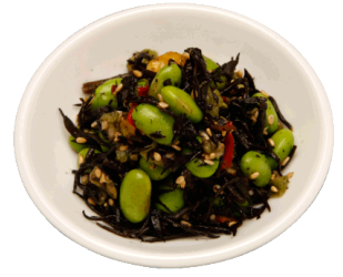
Edamame Salad Soybean Salad