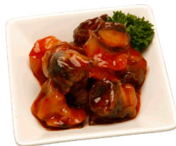
Tsubu Kimchee Whelk with Kimchee Sauce