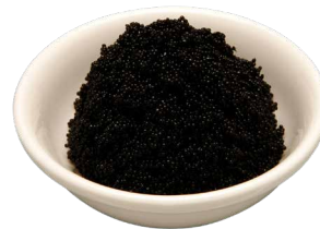
Masago Umami 'Black' Seasoned Capelin Roe 'Black'