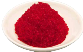
Tobikko Reserve Umami 'Red' Seasoned Flying Fish Roe with Herring Roe 'Red'