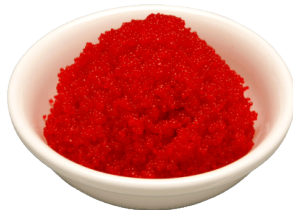
Masago Umami 'Red' Seasoned Capelin Roe 'Red'