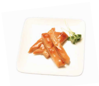
Teriyaki Calamari Grilled Jumbo Squid with Teriyaki Sauce