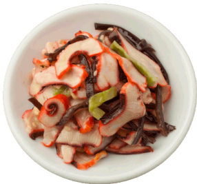
Chuka Ika Sansai "Delight" Asian Seasoned Jumbo Squid Salad