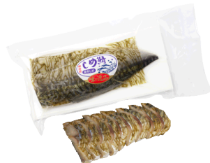
Shime Saba (L) Marinated Mackerel with Kelp