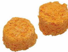
Golden Kaibashira Fry