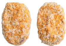
Purple Sweet Potato Croquette