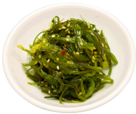
Goma Wakame Sesame Seaweed Salad