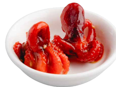
Chuka Iidako Seasoned Baby Octopus