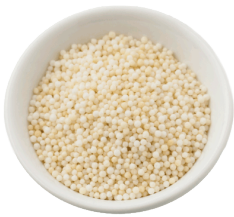
Masago Arare Rice Cracker Bits