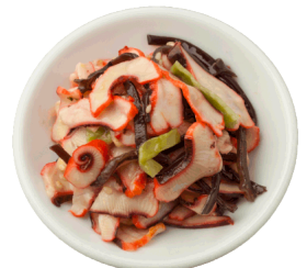
Chuka Ika Sansai Asian Seasoned Jumbo Squid Salad