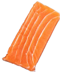
Plant-Based Sashimi 'Salmon'