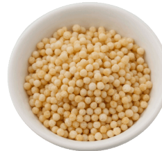
Tobikko Arare Rice Cracker Bits