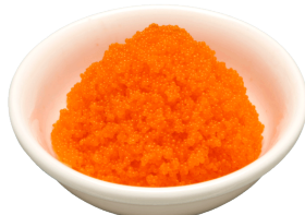
Masago Hybrid 'Orange' Seasoned Capelin Roe and Herring Roe with Soy Protein 'Orange'