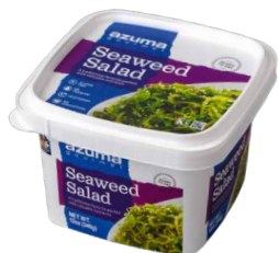
Seaweed Salad (12oz) Sesame Seaweed Salad