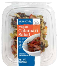
Plant-Based Calamari Salad (3oz)