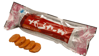
Ankimo Steamed Monk Fish Liver