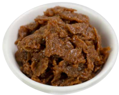
Veggie Meat 'Yakiniku' Seasoned Soy Protein with BBQ Sauce