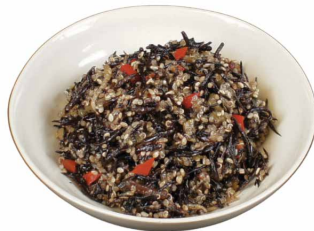
Hijiki Salad with Quinoa Hijiki Seaweed Salad with Quinoa