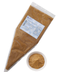
Uni Paste Seasoned Sea Urchin