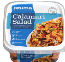
Calamari Salad (24oz) Seasoned Jumbo Squid with Vegetable