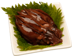
Hotaruika Okizuke Seasoned Petite Squid