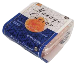
Masago Caviar Seasoned Capelin Roe with Herring Roe