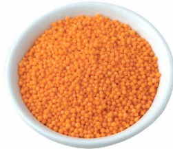
Masago Arare 'Orange' Rice Cracker Bits