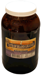
Royal Hawaiian BBQ Sauce