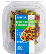
Spiced Mixed Grain & Edamame Salad (3oz)