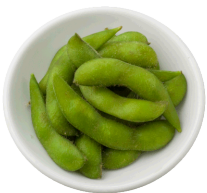
Edamame 'RB' Boiled Soybeans in Pod