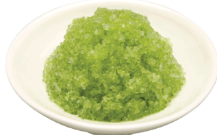
Tobikko Umami 'Wasabi' Seasoned Flying Fish Roe with Herring Roe 'Wasabi'