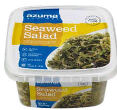
Naturally Colored Seaweed Salad (28oz) Sesame Seaweed Salad