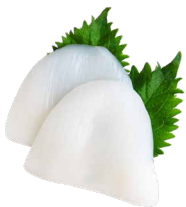
Osushiya Mongo Sliced Cuttlefish