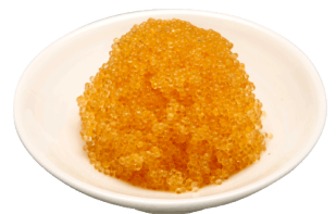
Tobikko Umami "Delight" Seasoned Flying Fish Roe 'Gold'