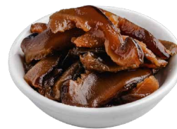
Ajitsuke Kizami Shiitake Seasoned Shiitake Mushroom