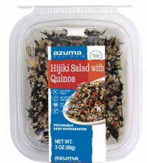
Hijiki Salad with Quinoa (3oz) Hijiki Seaweed Salad with Quinoa