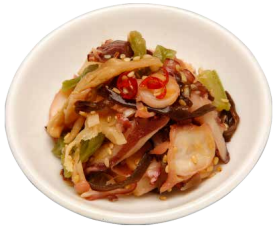
Chuka Tako Sansai Asian Octopus Salad