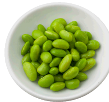
Organic Muki Edamame Boiled Shelled Organic Soybeans