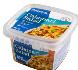
Calamari Salad (8oz) Seasoned Jumbo Squid with Vegetable