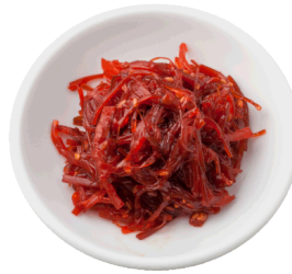
Spicy Wakame Spicy Seaweed Salad