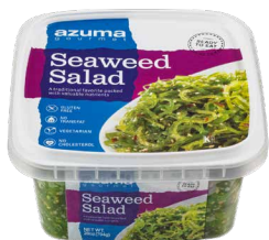
Seaweed Salad (28oz) Sesame Seaweed Salad