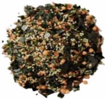
Umami Toppers 'Wasabi' Wasabi Flavored Seasoning Mix