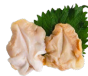
Tsubugai Slice Sliced Whelk