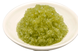
Masago Hybrid 'Jalapeño' Seasoned Capelin Roe and Herring Roe with Soy Protein 'Jalapeño'