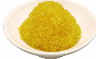
Tobikko Umami 'Yuzu' Seasoned Flying Fish Roe with Herring Roe 'Yuzu'