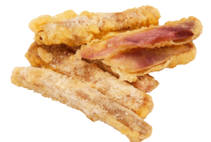
Purple Sweet Potato Tempura