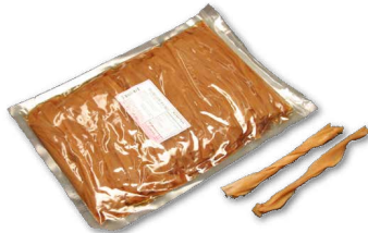
Ajitsuke Kanpyo "Delight" Seasoned Gourd Shavings