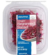
Ginger Seaweed Salad (3.5oz)