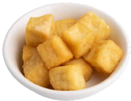
Fried Tofu Bites