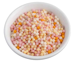
Tobikko Arare 'Rainbow' Rice Cracker Bits