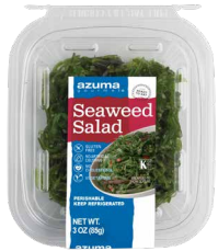
Naturally Colored Seaweed Salad (3oz) Sesame Seaweed Salad