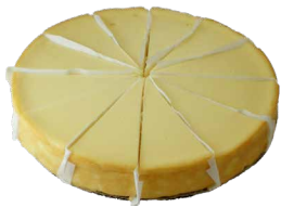
Cheesecake 'New York Style'