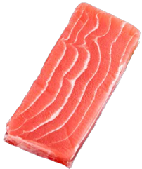
Plant-Based Sasimi 'Tuna'