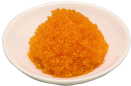
Tobikko Reserve Umami 'Orange' Seasoned Flying Fish Roe with Herring Roe 'Orange'