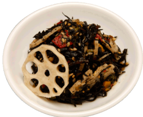
Hijiki Salad Hijiki Seaweed Salad