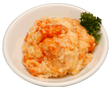
Osushiya Salad Crawfish and Herring Roe Salad