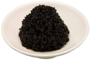
Tobikko Umami 'Black' Seasoned Flying Fish Roe 'Black'