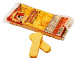
Reito Tamago Yaki Cooked Egg for Sushi