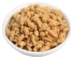
Soya Ground 'Plain' Ground Soy Protein