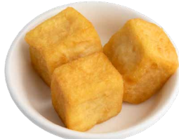
Fried Tofu Cubes