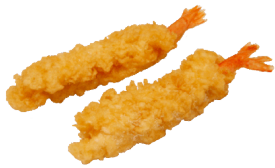
Shrimp Tempura Pre-Cooked Shrimp Tempura