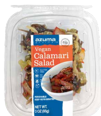
Plant-Based Calamari Salad (3oz)