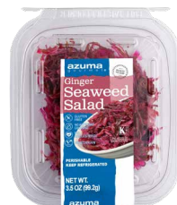
Ginger Seaweed Salad (3.5oz)