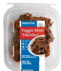
Veggie Meat 'Yakiniku' (3oz) Seasoned Soy Protein with BBQ Sauce