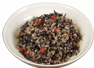
Hijiki Salad with Quinoa Hijiki Seaweed Salad with Quinoa