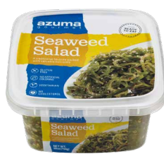
Naturally Colored Seaweed Salad (28oz) Sesame Seaweed Salad