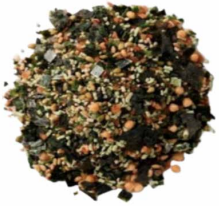
Umami Toppers 'Wasabi' Wasabi Flavored Seasoning Mix