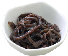
Ramen Kikurage Seasoned Wood Ear Mushroom