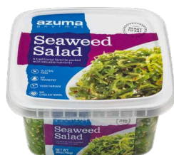
Seaweed Salad (28oz) Sesame Seaweed Salad