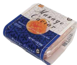
Masago Caviar Seasoned Capelin Roe with Herring Roe