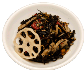
Hijiki Salad Hijiki Seaweed Salad