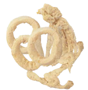
Ika Karaage Squid for Frying