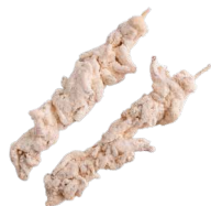
Squid Karaage Kushi Breaded Squid on Skewer