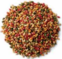
Umami Toppers 'Rainbow Sesame' Mixed Seasoned Sesame Seeds