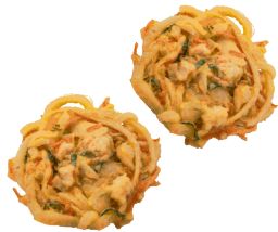
Ebi Kakiage Shrimp & Mixed Vegetable Tempura