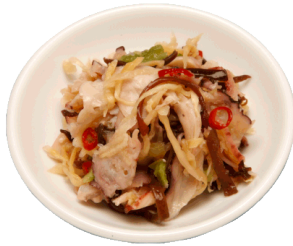
Gari Tako Sansai Seasoned Octopus with Vegetables and Ginger