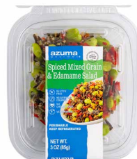
Spiced Mixed Grain & Edamame Salad (3oz)