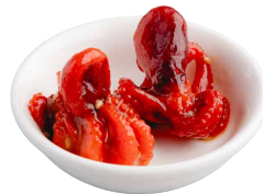
Chuka Iidako Seasoned Baby Octopus