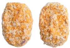
Purple Sweet Potato Croquette