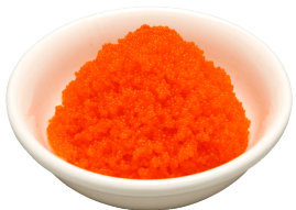
Masago Seasoned Capelin Roe