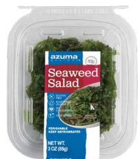
Naturally Colored Seaweed Salad (3oz) Sesame Seaweed Salad