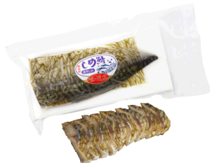
Shime Saba (L) Marinated Mackerel with Kelp