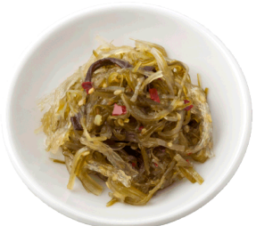
Goma Wakame "Delight" Sesame Seaweed Salad