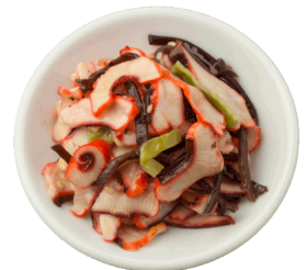
Chuka Ika Sansai Asian Seasoned Jumbo Squid Salad