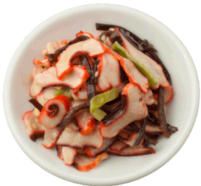
Chuka Ika Sansai "Delight" Asian Seasoned Jumbo Squid Salad