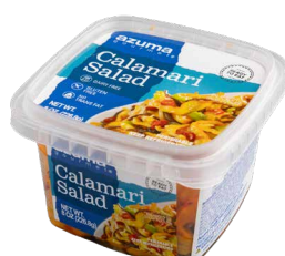
Calamari Salad (8oz) Seasoned Jumbo Squid with Vegetable