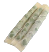
Edamame Stick Soybean in Wheat Wrapper for Frying