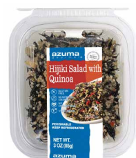
Hijiki Salad with Quinoa (3oz) Hijiki Seaweed Salad with Quinoa