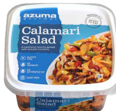
Calamari Salad (24oz) Seasoned Jumbo Squid with Vegetable