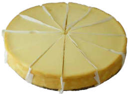
Cheesecake 'New York Style'