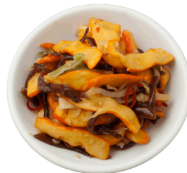
Calamari Salad "Delight" Seasoned Jumbo Squid with Vegetables