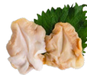
Tsubugai Slice Sliced Whelk