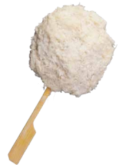
Shrimp Swirl Pops Breaded Shrimp Skewers