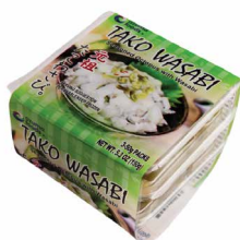
Tako Wasabi Retail Seasoned Octopus with Wasabi