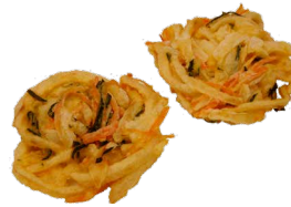
Yasai Kakiage Vegetable Tempura