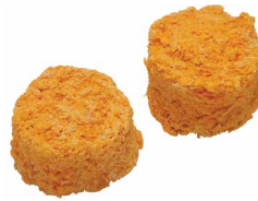
Golden Kaibashira Fry Breaded Imitation Scallop