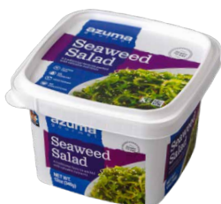
Seaweed Salad (12oz) Sesame Seaweed Salad