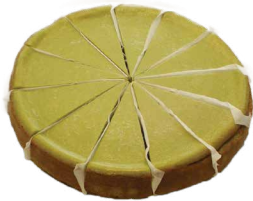
Cheesecake 'Green Tea'