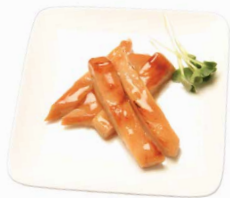
Teriyaki Calamari Grilled Jumbo Squid with Teriyaki Sauce