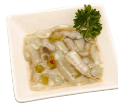
Tako Wasabi Seasoned Octopus with Wasabi