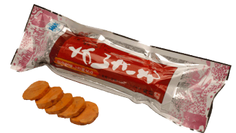
Ankimo Steamed Monk Fish Liver