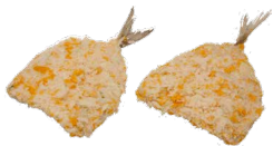
Aji Fry Breaded Yellowstripe Scad