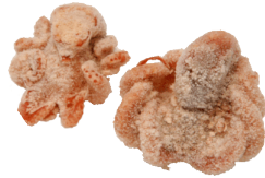
Lidako Karaage Baby Octopus for Frying