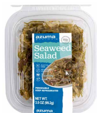
Seaweed Salad Vegan (3.5oz) Sesame Seaweed Salad